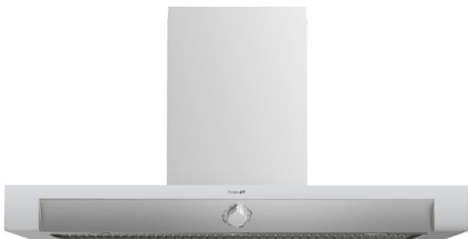
Cucinotta Hood 48"