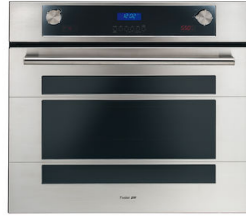
Oven Milano single Stainless Steel 30"