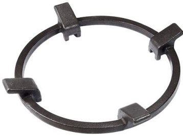
Cast Iron Wok Support